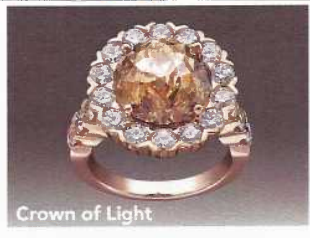
Crown of Light