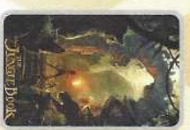
5:45 pm & 8:15 pm Duration: 1 hr 46 mins Rating: PG