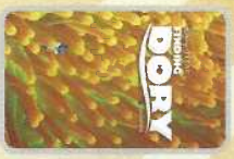
Open Captioning 8:30 am Duration: 1 hr 45 mins Rating: PG