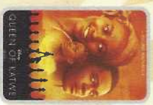
1:00 pm Duration: 2 hrs 4 mins Rating: PG