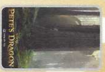
10:30 pm Duration: 1 hr 42 mins Rating: PG